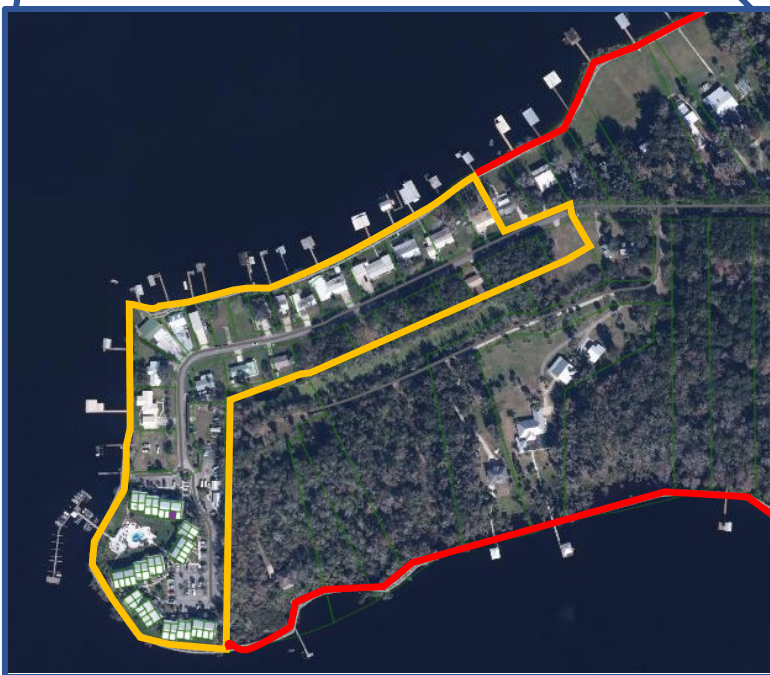
Excepted Area from Welaka Chapter 180 Utility District: Beechers Point S/D (MB5 P76)