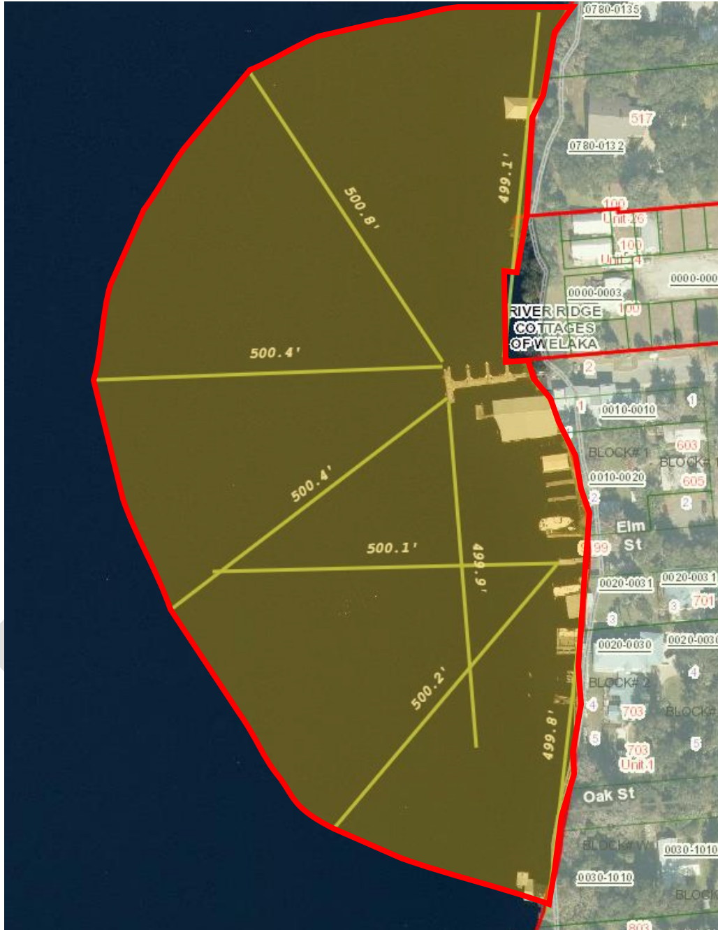
EXHIBIT B Welaka No Wake Zone Ordinance