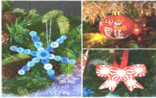
Handmade ornaments and crafts.