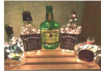
decorative bottle lamps