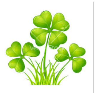
Thursday, March 19<sup>th-</sup> Spring Begins