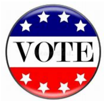
Friday, March 20<sup>th</sup> – Swearing in Ceremony @ 7:00 p.m.

<u>Special days this month:</u> Tuesday, March 17<sup>th</sup> – Election Day